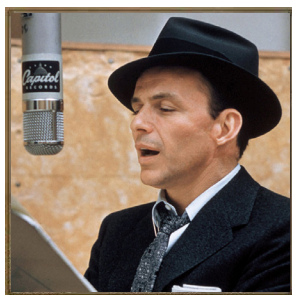
Frank Sinatra Singer