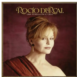
Rocío Dúrcal Singer