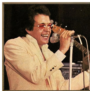
Héctor Lavoe Singer