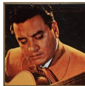
Cuco Sánchez Singer & Composer