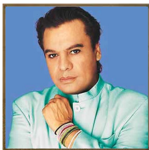
Juan Gabriel Singer & Composer